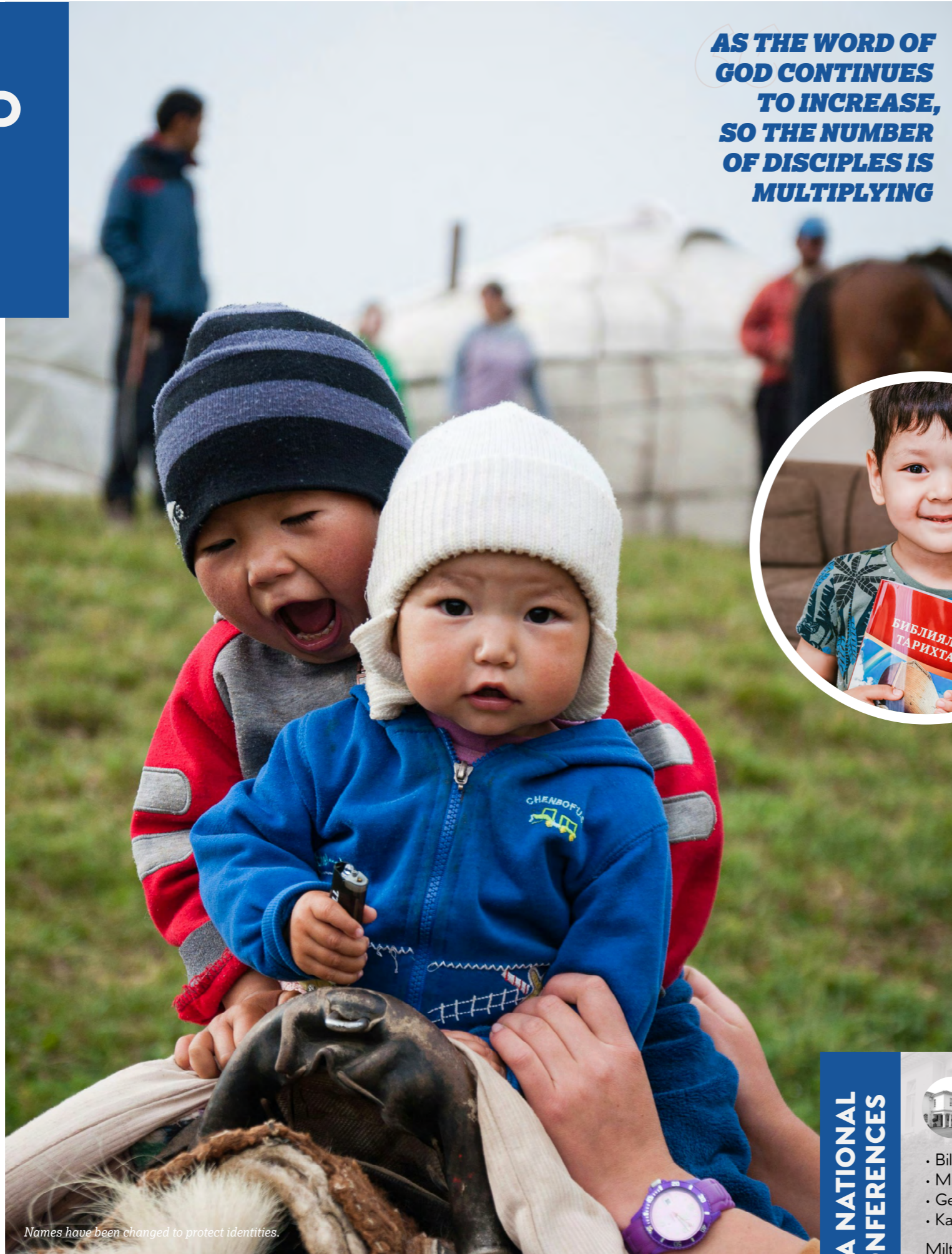
Names have been changed to protect identities.

Please join us in the continuing work of making the Word of God available in Central Asia.